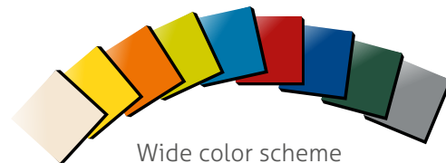
Wide color scheme