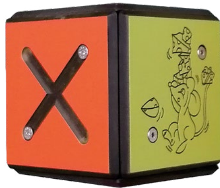
Combination of different play ideas